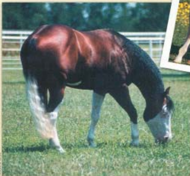
Top right: Colonels Lone Gun as a colt when he appeared on the cover of the May 1999 Journal.

Above: Today, "Lone Gun" is a handsome Paint stallion in Pauls Valley, Oklahoma.